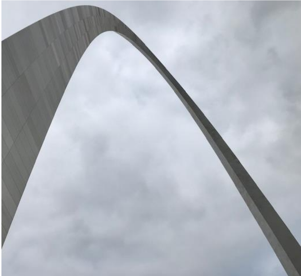
The Gateway Arch, St. Louis, Missouri, 2019